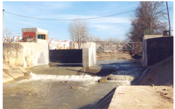
Inflatable at Arrabalde: view downstream of the two spans, cofferdam and house to electrical controls

The implementation of the new dam, comprised the construction of two side meetings, a central pillar and from two wells, one on each bank, which host the servo motors driving the floodgates. The work also included the automation of the two water intakes for irrigation.