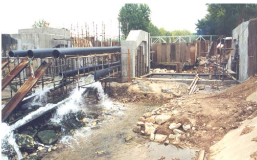
Inflatable weir at Arrabalde: river to flow only in the lower tubes, during the execution of work