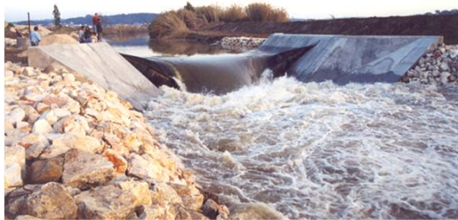
Açude das Salgadas: vista de jusante da margem direita (açude a descarregar com o insuflável a esvaziar)