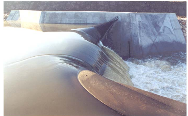
Açude das Salgadas em plena carga (pormenor do insuflável)

The dam of Salted located approximately 30 kilometers to the river Lys, near Mount Royal, a section of the bed and settled contributes more as a fundamental part of the irrigation system of the fields of the Valley of Lis. The rehabilitation of the dam's main goal was to replace the existing structure that was obsolete (about 50 years), creating a plan to allow sufficient water supply to the needs of water and flow downstream requested by making water in the left margin. The work consisted of a "inflatable dam" which broadly comprises a threshold based on eight concrete piles with 60 cm diameter and depth between 18 and 24 meters, in which a chamber is recessed synthetic rubber reinforced. The rehabilitation also included the automation of irrigation water outlet.